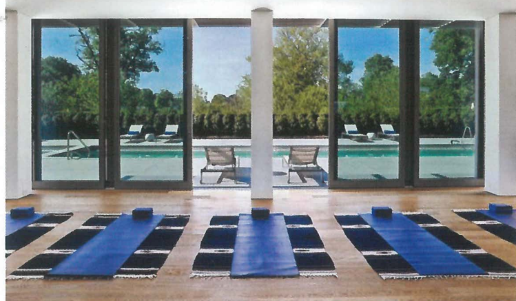
Inside The Spa at Topping Rose House, in Bridgehampton.