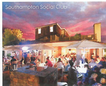
Southampton Social Club