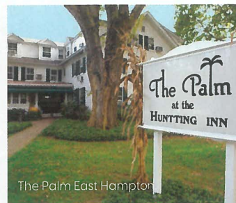
The Palm East Hampton